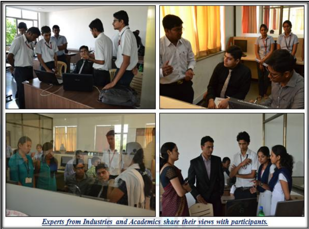
Experts from Industries and Academics share their views with participants.