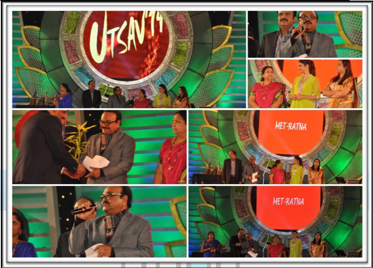
MET RATNA Awards Distribution