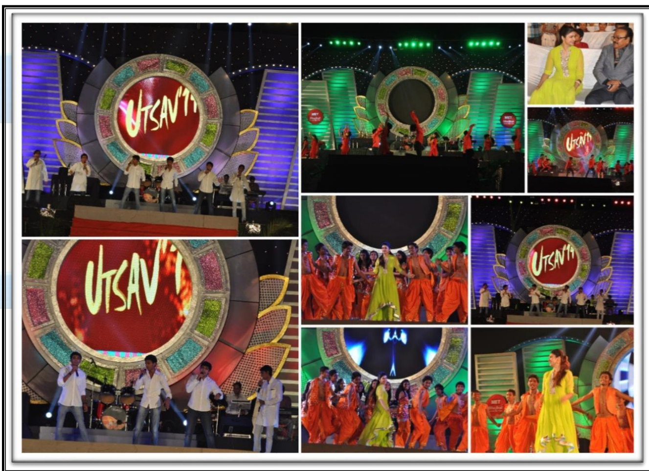
Students' Performances at UTSAV'14