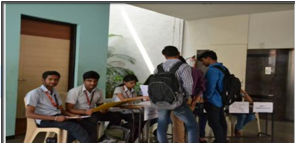
Registration for the Competition

Participants for the event are from final year students of Engineering from the Maharashtra State. The arrival of participants to the venue starts from 9 am sharp. The crowd is guided by the student volunteers. They register themselves at registration desk.